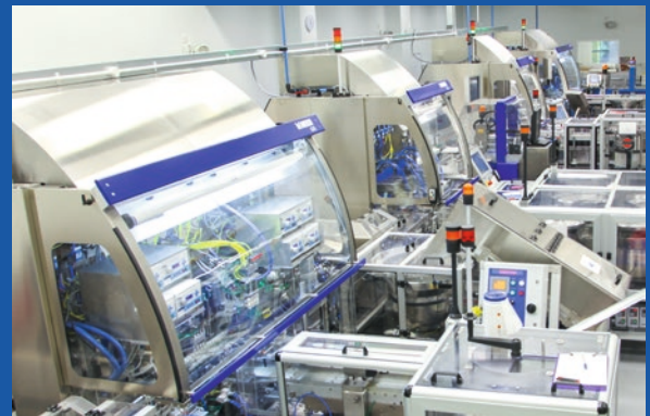
Figure 1: High-performance automatic assembly and test systems.

Providers of automation solutions should be involved from the very beginning of product development. As a fully integrated project partner, we often learn all about the process at the same time as our customer. We always have a sound grasp of the risks involved and, through constant communication, we are able to anticipate future changes – from design for assembly to proof of principle, and from the validation process through to the pilot line and highperformance production (Figure 1).