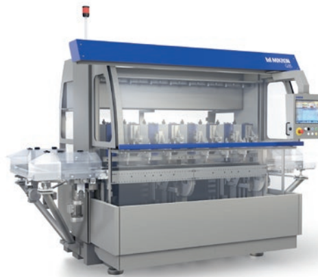
Mikron G05 2 Modules