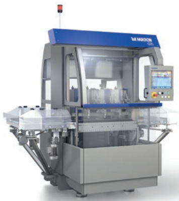
Mikron G05 1 Module

be linked together depending on project requirements which allows full layout flexibility. The linear concepts gives Improved accessibility for material flow both to and from the assembly line and also very quick access for operators and maintenance personal. The use of manual working stations, semi- and fully automatic cells offer progressive investment from pilot to fully automatic lines.