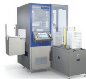
Mikron Tray Handler