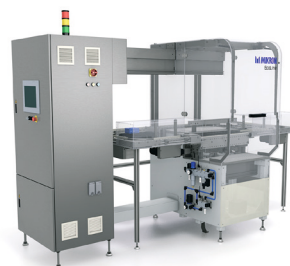
Mikron EcoLine™ Assembly Automation