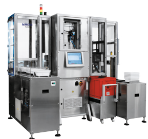
Mikron Tray Handler