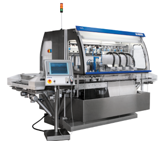
Mikron G05™ Assembly Automation